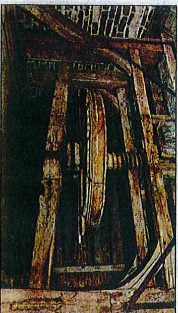
An ancient wine press at the Abbaye de la Bussiere.

make wines for the sacrament. The 18 lake- and garden-view rooms and suites have been completely restored