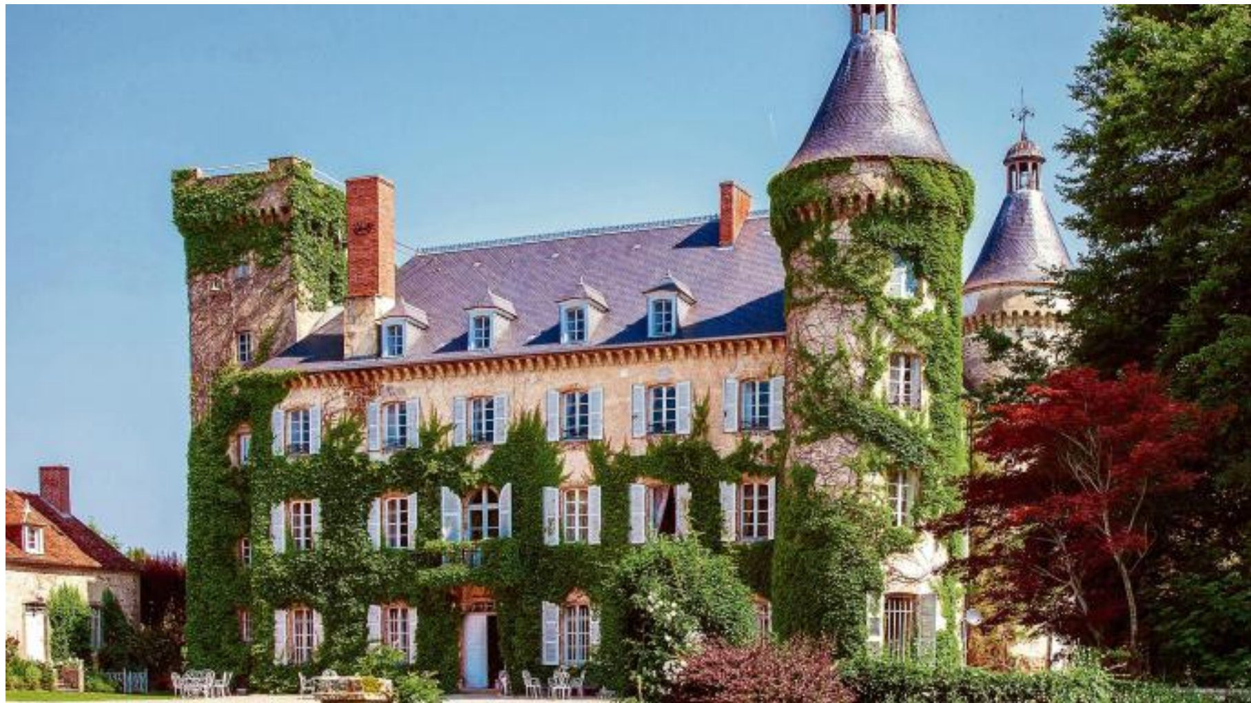
Château du Ludaix is in rolling countryside in one of the least-populated parts of France