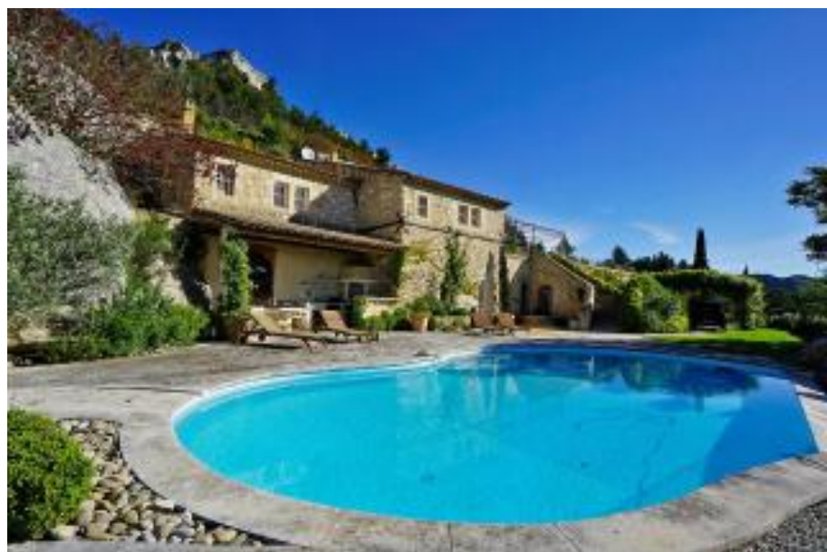
Les Rochers: a former Roman villa in the heart of the Luberon

Details Gîtes for four are from €100 a night or from €420 a week (00 33 476 38 90 50, cabanecafe.com ). Fly or take the Eurostar to Lyons