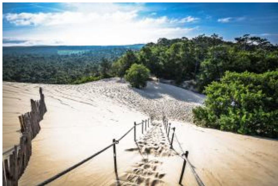
Dune du Pyla — Europe’s biggest sand dune — in Arcachon Bay

Details Doubles cost from €140 a night; sea-view suites from €290 (00 33 2 98 61 13 29, hotel-brittany.com ). Take the ferry to Roscoff, or fly to Brest