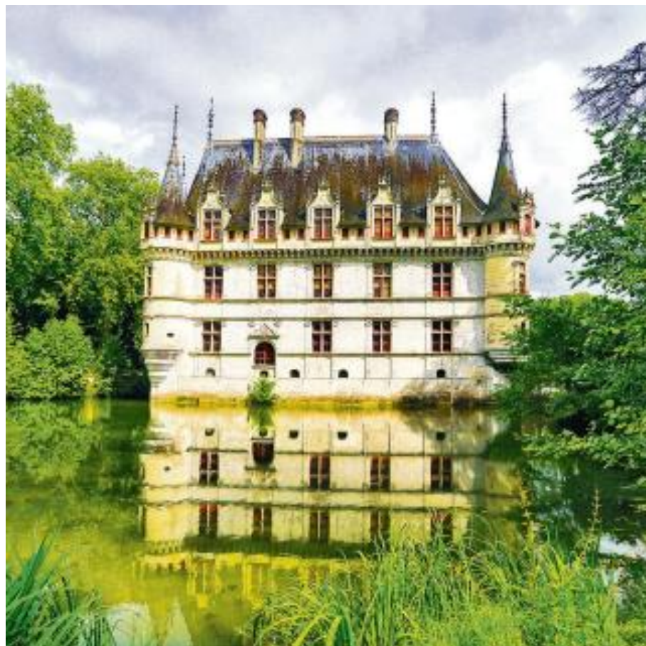
The fairytale Azay-le-Rideaux château in the Loire Valley

Details Seven nights at the six-bedroom Maison de Cannes villa, with pool, hot tub, sauna and gym, costs from €2,436 and is €5,517 during the festival (0800 1337999, oliverstravels.com ). Or the four-star Hotel Le Mondial has 49 rooms with doubles from €150 (00 33 4 93 68 70 00, hotellemondial.com ). Fly to Nice