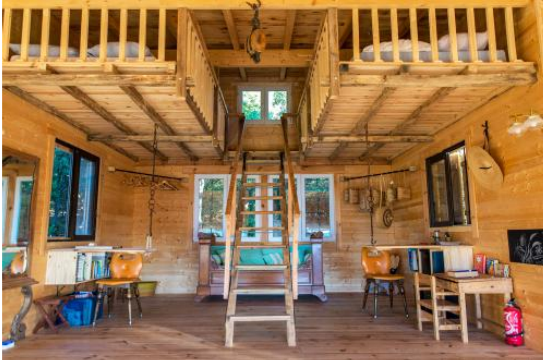
The off-grid Château dans les Chênes is surrounded by hilly forests and has a rainwater shower