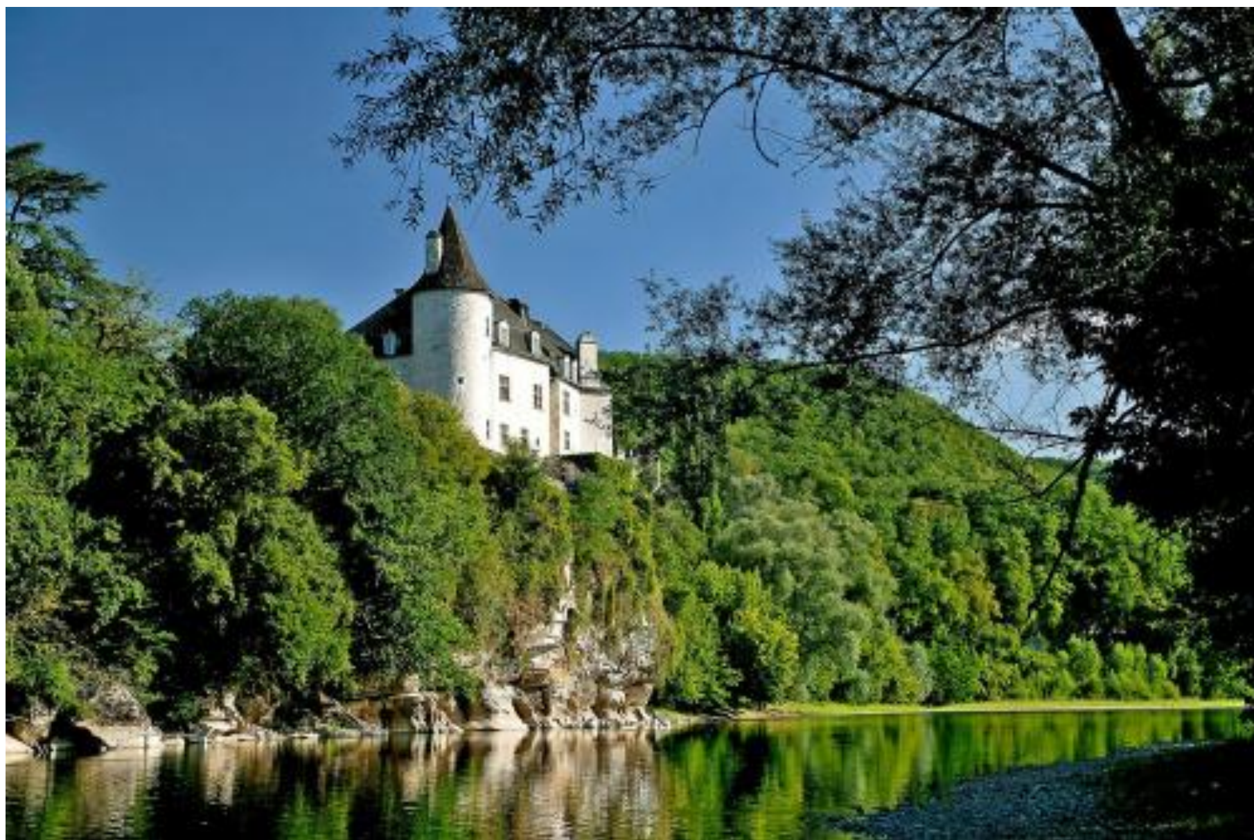
Cast off on the Dordogne at the Château de la Treyne

Details The Festival des Roses is on May 27-28 ( chedigny.fr ). Doubles cost from £95 a night, breakfast £5pp, or seven nights in the apartment for six costs £800 (00 33 2 47 92 55 88, loire-chateau.fr ). Fly to Tours