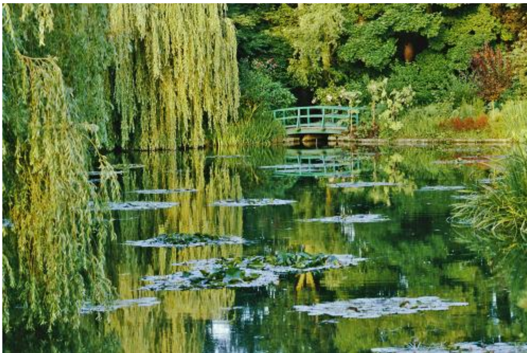
A stop-off at Claude Monet's garden at Giverny can be arranged as part of Château la Chenevière's tour

Details A night's B&B with a three-hour personal fashion tour costs from €443 for two (00 33 1 42 74 10 10, hotelpetitmoulinparis.com )